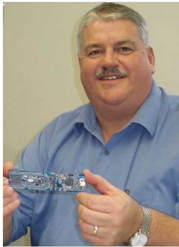
LPCXpresso Development Kit.

In addition, we've adopted the same form-factor as the recently launched, popular mbed rapid prototyping tool. This LPCXpresso board had been designed to be pin-compatible with the popular recently launched mbed rapid prototyping tool. After doing evaluation projects or proof of concept prototyping, the user can move on to a more formal development tool based on the LPCXpresso system. This really provides a continuum between the mbed world, for the new users, and fast adopters, through to the formal software verification and production stage.