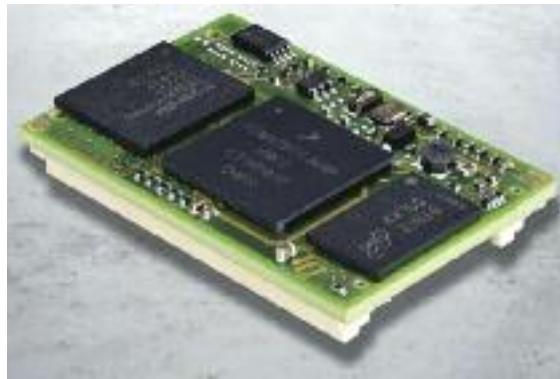
TQ ARM9 module with Freescale i.MX28 processor

Some providers on the market have "defined" their "company standard." To ensure the module is not too big, however, a maximum of only 60 percent of interfaces is generally available for company standards, and these are the ones common to all processors. In extreme cases involving a standard with 100 defined pins, of which approximately 70 are signal pins, using a TI OMAP35xx with approximately 250 signals, this leads to approximately 180 signals which are not built in from the module, i.e. are not available to the user. On the x86 market, it makes perfect sense to switch modules if, for example, the application requires more output. As the core is always x86, i.e. the software is always the same, it is possible to switch from one COM Express module to the next without any problem. The so-called company standards often even involve different processors from ARM9 to x86, which covers a wide range of performance, but requires varying software. An exchange, particularly with differing sizes, appears to be more of a marketing ploy than a real solution.